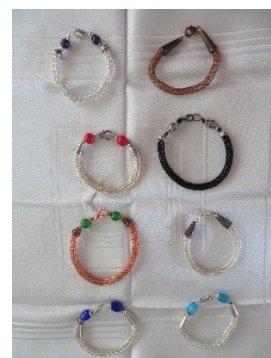
Rosemailed spoon, wheat straw heart, Norwegian flag crate or box, Viking Knit bracelet